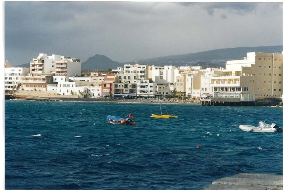
in El Médano, a dull city with very little to do