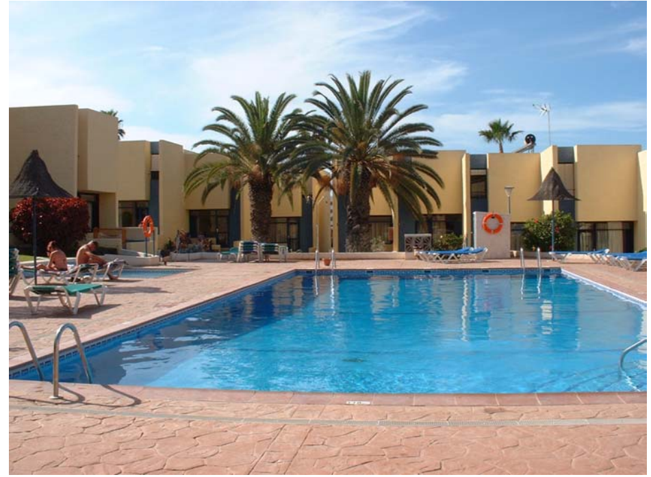
A middle class comfortable accommodation