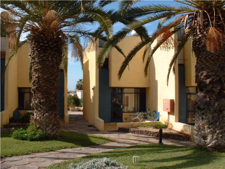
El Cortijo Apartments, Playa de Las Americas Dec 2004