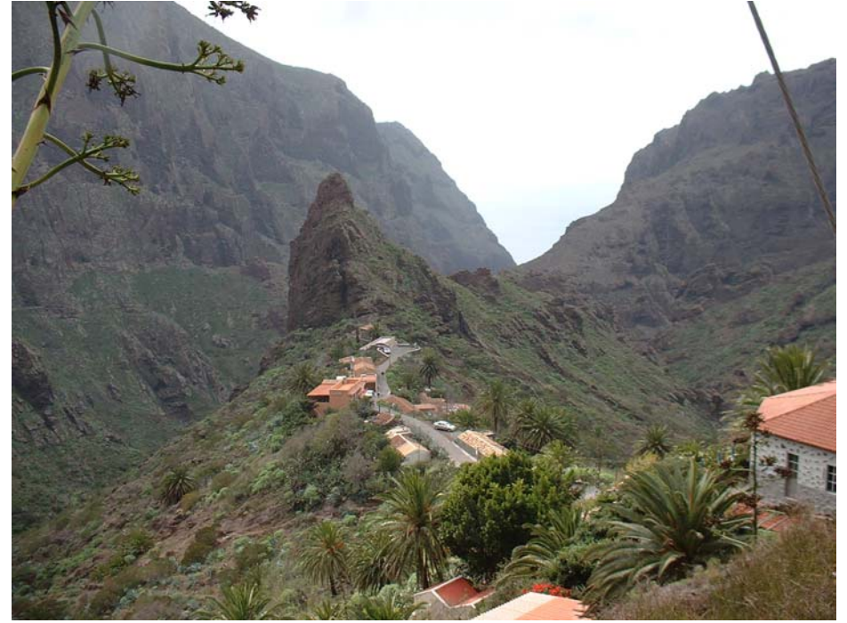
Masca . .