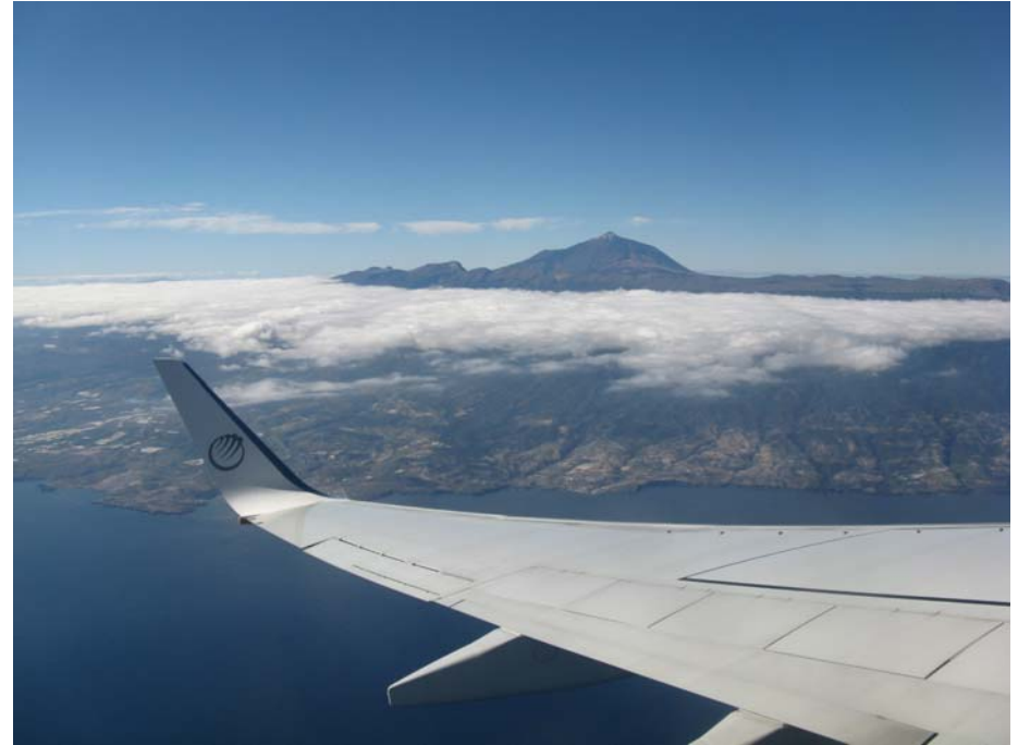
Hasta la vista, Tenerife Gracias por este tiempo