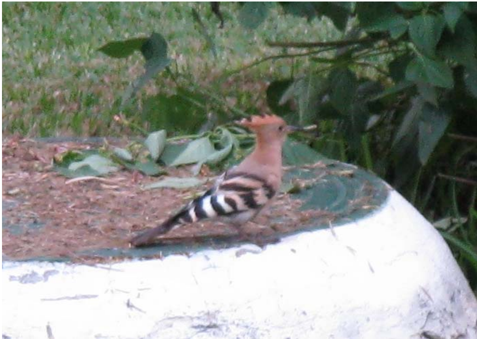
Hoopoe bird in the park beside our hotel