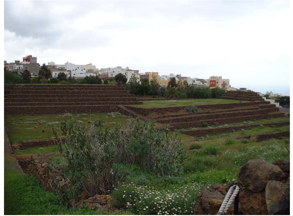
Pyramids of Güímar Museum and models of the reed boats Ra II and Tigris, of Thor Heyerdahl