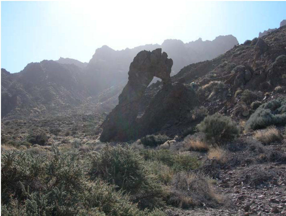
The queens shoe