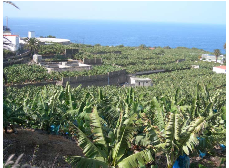
Banana plantations along the Northern coast