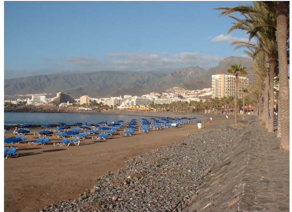
Playa de las Americas