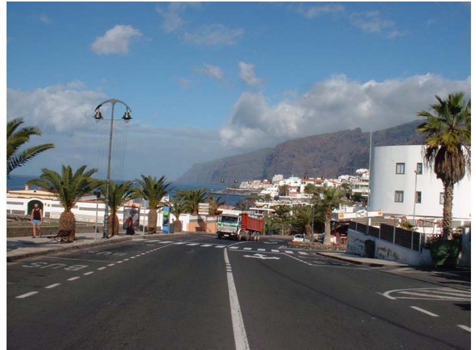
Playa de Las Americas by day and by night