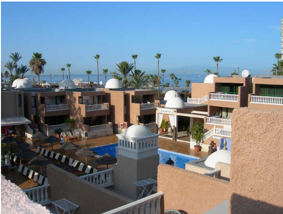
Parque de Las Americas Dec 2006 + Jan 2008