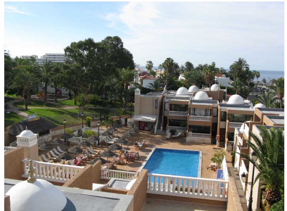
A great location with a very good standard apartment