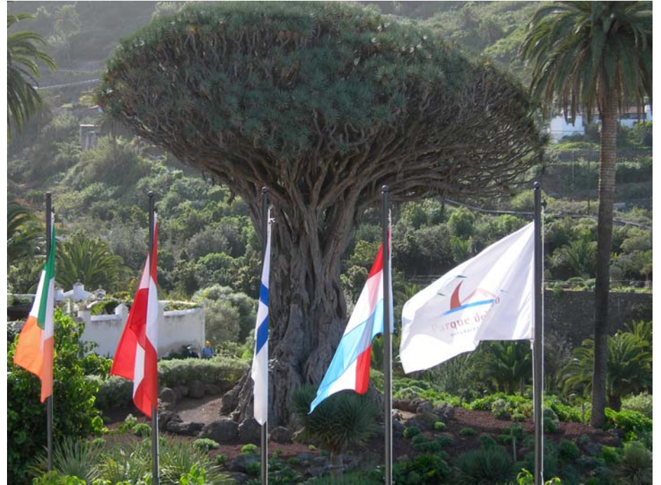
Icod de Los Vinos Millennium Dragon Tree