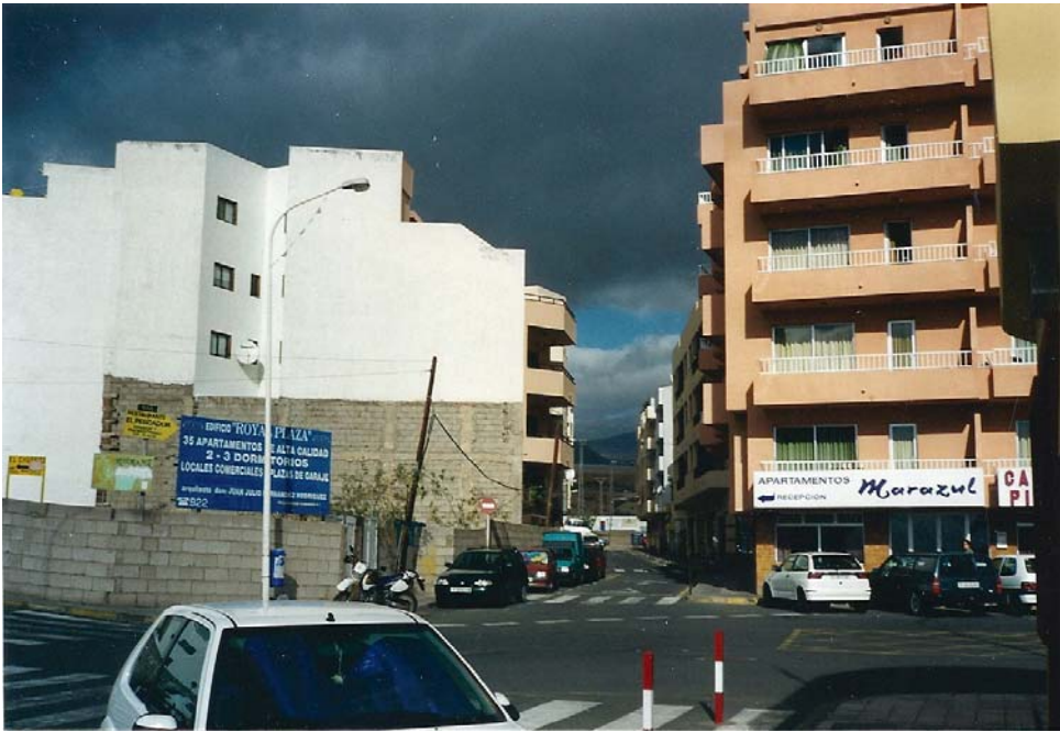
Hotel Marazul El Médano, Dec 24, 2000 – Jan 7, 2001