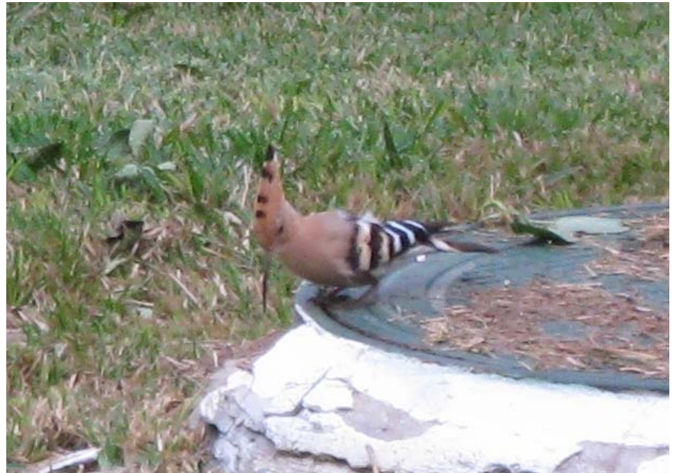
Sunset as seen from our terrace